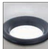
Waste chute + rubber flange, 701 102