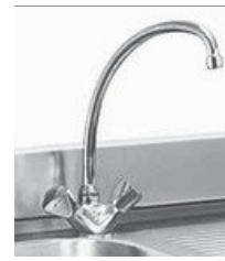
Robinet 230 300