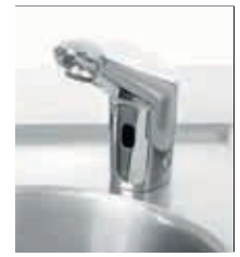
Robinet 230 507