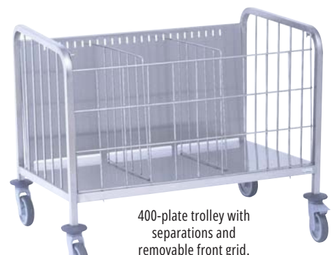
400-plate trolley with separations and removable front grid.

The trolleys (200 and 300 plates) can be delivered in flat packs to keep transport and storage costs down.