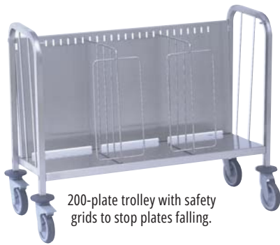
200-plate trolley with safety grids to stop plates falling.