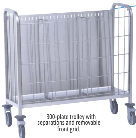
300-plate trolley with separations and removable front grid.

The trolleys are fitted with either safety grids to stop plates falling, or simple separations with a front grid.