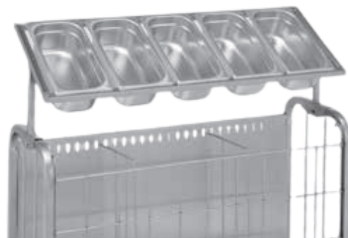
Cutlery dispenser (capacity 5 GN1/3 pans not supplied), height 300 mm - Ref: 800 571