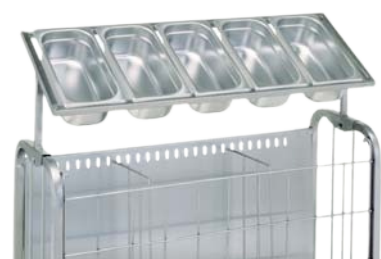
cutlery dispenser ref. 800 571 (containers extra)