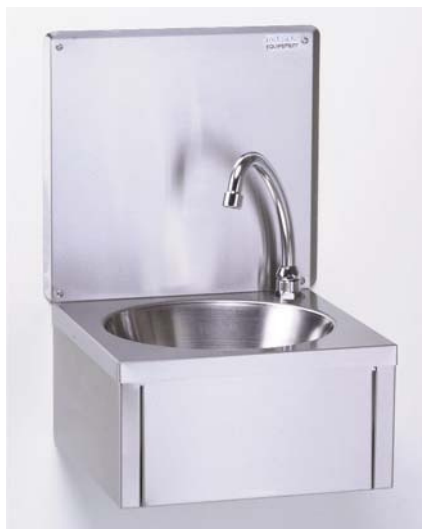
Ref.: 806 332