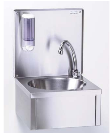
Ref.: 806 333

Made out of grade stainless steel, the GA wash basin is designed to last under the most intensive working conditions. The water supply is controlled by a knee-actuated paddle.