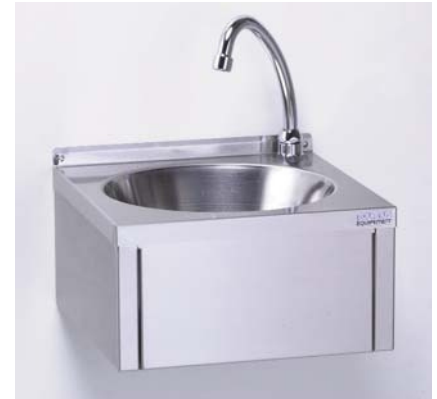
Ref.: 806 331

The GA wash basin's compact size means it can fit into all kinds of premises, even the tiniest. Square in shape, 30 x 30 cm, it provides the ideal solution for hand-washing without taking up too much space.