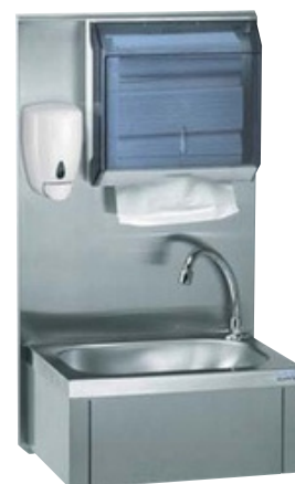
Ref. : 806 385

The GC wash basin with 540 mm high splash back: the splash back is especially designed to make splashes run back into the bowl so that the wall is completely protected against dampness. The splash back includes an integral soap dispenser, capacity 350 ml.