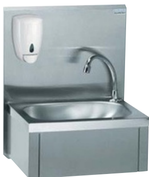
Ref. : 806 383

The GC wash basin with 540 mm high splash back: the splash back is especially designed to make splashes run back into the bowl so that the wall is completely protected against dampness. The splash back includes an integral soap dispenser, capacity 350 ml.