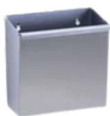
Ref: 806 395

Wall-mounted waste bins: made of stainless steel or made of PVC