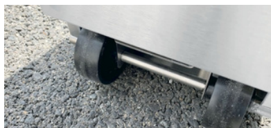
An anti-theft system (chain, cable) can be attached to the wheel axle or handle.