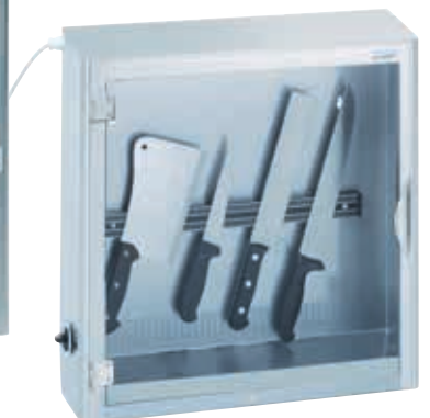
Ref: 806 422