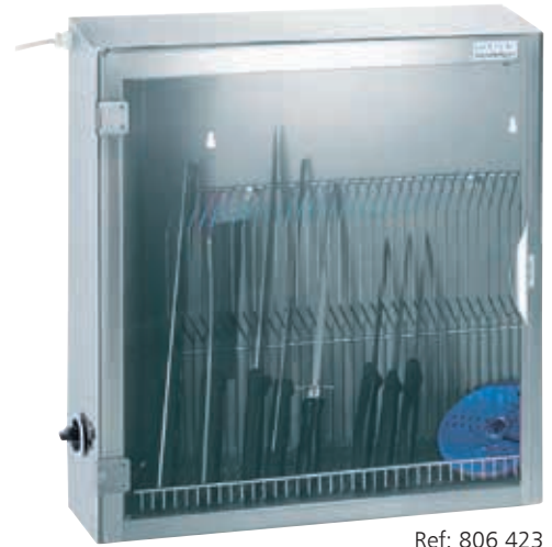
Ref: 806 423

The stop holds the knives of cutter blades, thereby limiting any risks of them falling out and therefore injury.