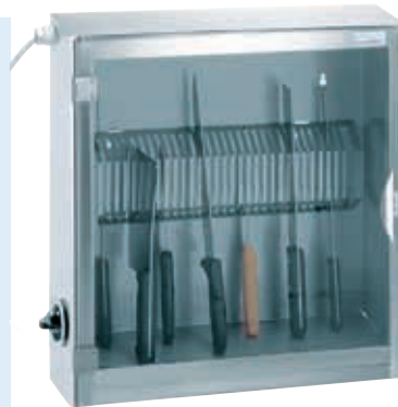
Ref: 806 421

All the cabinets are also available with lock and key.